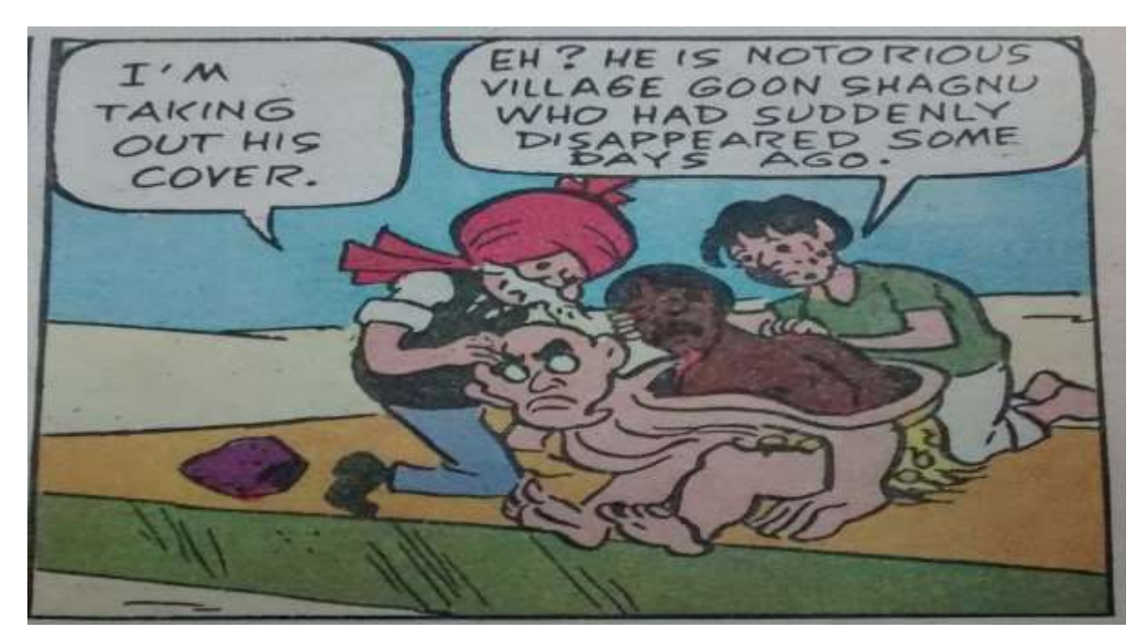
Fig.3 'Jal Baba' Chacha Choudhary (Diamond Comics-689)

The binary of black and white has been used to mark the character of Shagnu as lower caste. In the collective unconscious mind of the upper caste, the lower caste is supposedly dark-skinned in shabby clothes. Shagnu succeeded to convince the villagers of his identity as baba because he was wearing fair-skinned mask that enabled him to resemble one of from the villagers. The moment, he is exposed by the eponymous hero, the mask functions to differentiate from the upper caste and vilify him as outcaste.