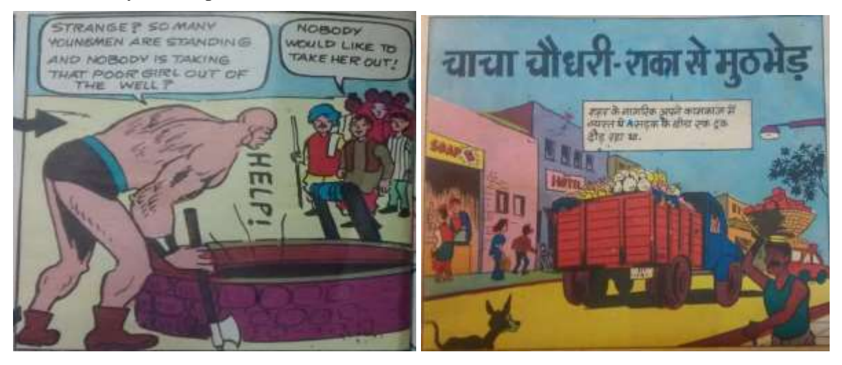
Fig.7 the lower caste characters as minor characters in Chacha Choudhary comic book series

In most of the stories in the comic book series, the lower caste characters appear as minor characters who are seen only as either as street-dwellers or poor working class, bumping coincidently into hero or villains. However such depiction of the lower caste characters is not a narrative design to depict the diversity of Indian society. Rather their marginalization is naturalized by such representation in the comic book.