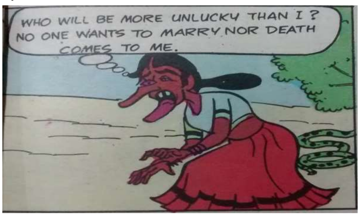
Fig. 9 'Manko's marriage' Chacha Choudhary (Diamond Comics-335)

In the discourse casteism, the lower caste woman is projected as lecherous, greedy and insolent, who acts on her impulses, instead taking rational decisions. Even the lower castes women are portrayed as disfigured and indecent, differentiating them from upper caste fair and sophisticated women. In the story 'Manko's marriage' Chacha Choudhary (Diamond Comics-335), the lower caste woman is seen devilish in both appearance and nature, projecting appearance as extraneous expression of the inner mind.