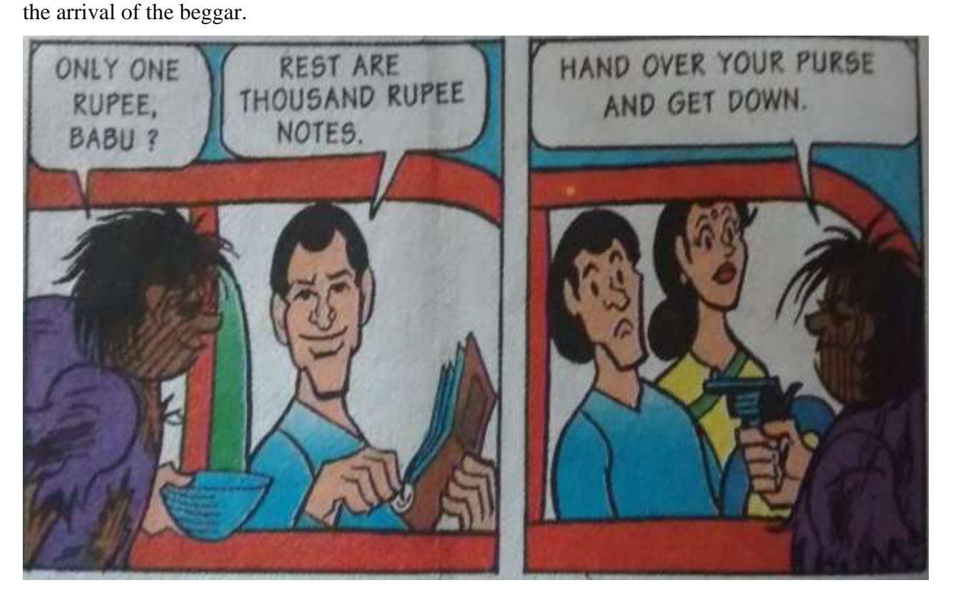
Fig.1 Fraud Begger' Chacha Choudhary (Diamond Comics -1706)

In the story 'Fraud Begger' Chacha Choudhary (Diamond Comics -1706), the lower caste character is seen as criminal minded beggar who attempts to earn money by deceiving 'bhadralok' urban middle class. His presence in the urban middle class space is described in terms of encroachment of the urban middle class space. The panel in which the beggar is visualized as rogue foregrounds the urban middle class setting which seems to be in chaos due to