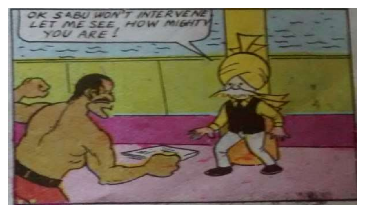
Fig.5 'The Dentist' Chacha Choudhary (Diamond Comics- 253)

While Chacha Choudhary is engrossed in his leisure time, the wrestler challenges him for a fight, questioning his hegemonic power in the society. The wrestler is not only lampooned but also thrashed badly by Chacha Choudhary, legitimizing the subordinate position of the lower caste in the stratification of the Indian society.