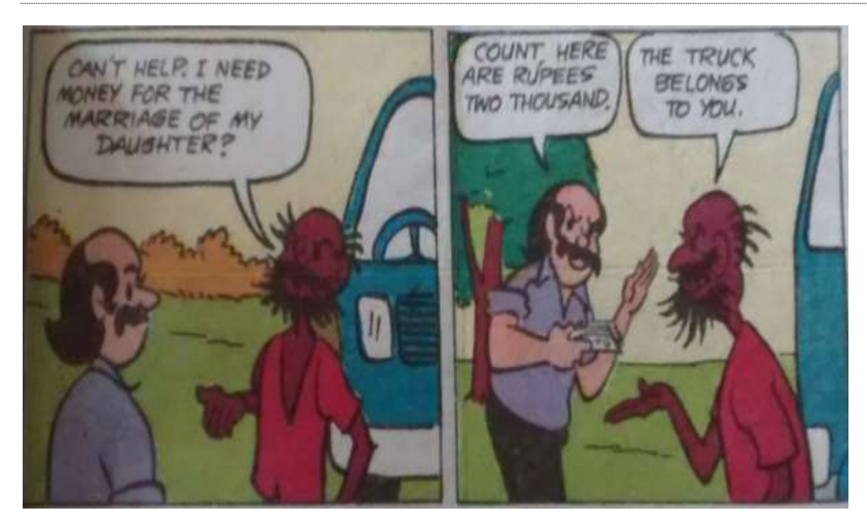
Fig.4 'Truck for Sale,' Chacha Choudhary (Diamond Comics -556)

The lower caste Shagnu is pitted against the upper caste characters, and through visualization of encoded caste differences, he is stigmatized and excluded from the national culture. His presence merely functions to exhibit the threatened upper caste culture due to the ambiguous presence of criminal minded lower caste people.