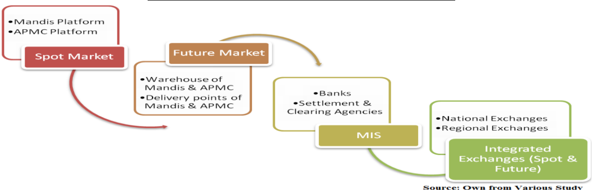
GRAPH 5 : VIRTUAL MARKET PROCESS FLOW

The integrated market will have a kind of exchange with the following features: